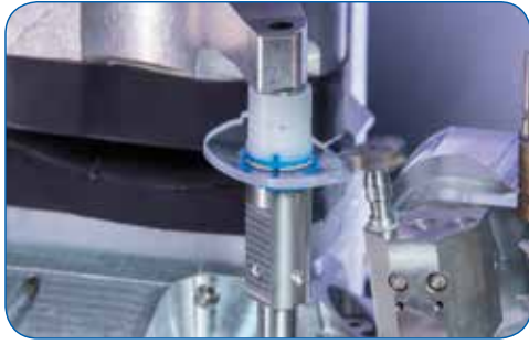
Shelving complex shapes