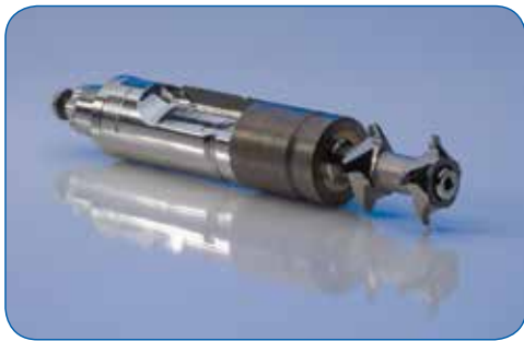
Innovative dual diamond blade tool