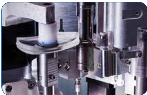
Environmentally-friendly dry edging